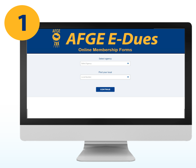
Go to www.joinafge.org

This is urgent. There are new threats to kick you out of your union. This is a brazen attempt to silence your voice at work and stop your union from defending your pay and retirement. We can't let them get away with this. You can stay a member of your union by signing up to pay your union dues online through a system called AFGE E-Dues. Follow these simple instructions to stay a member of your union by signing up for AFGE E-Dues using a credit card, debit card, or bank draft: