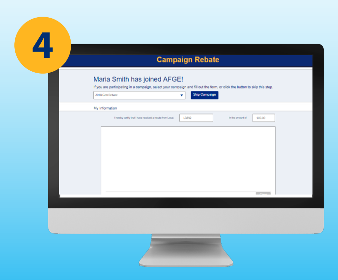
If you're a new member, select a rebate campaign and fill out the brief form (local participation may vary)