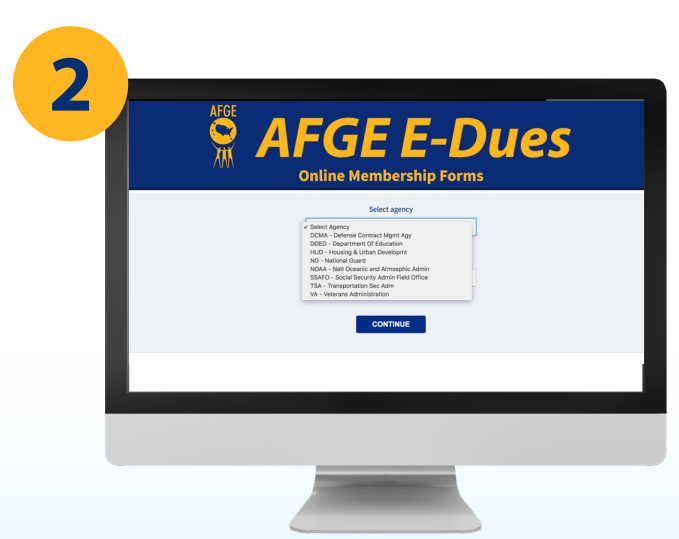
Select your Agency and Local Number