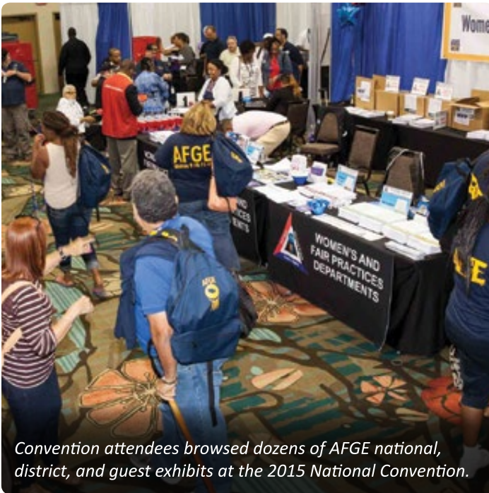
Convention attendees browsed dozens of AFGE national, district, and guest exhibits at the 2015 National Convention.