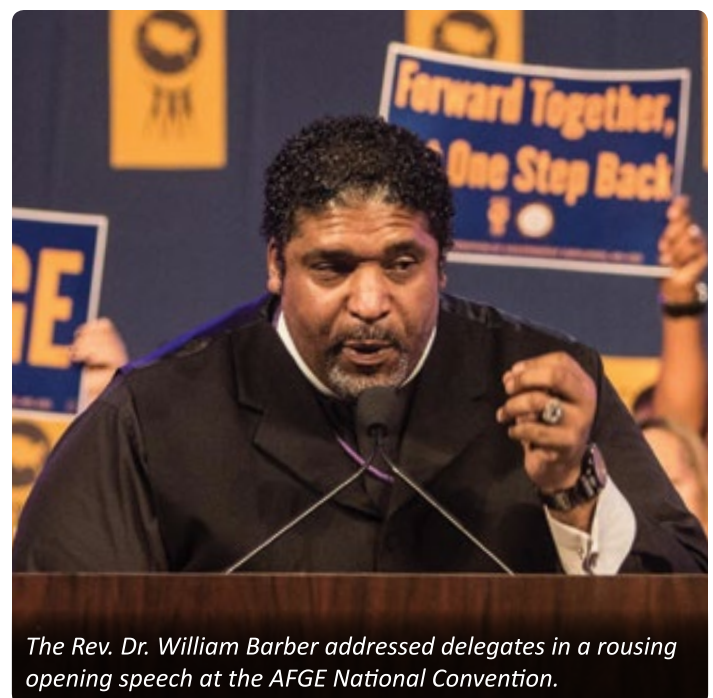
The Rev. Dr. William Barber addressed delegates in a rousing opening speech at the AFGE National Convention.

"The labor movement needs to be Big Enough to Win. And not only big enough and strong enough, we need to be united enough to win because all workers are under attack," he said, adding that the system is rigged in favor of the rich and big corporations. While big banks got bailed out, government employees got cuts to pay and retirement.