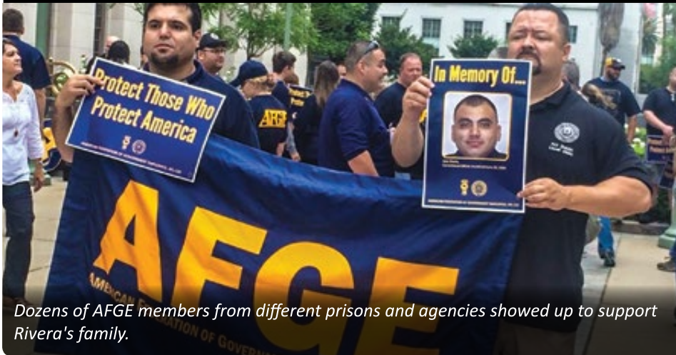
Dozens of AFGE members from different prisons and agencies showed up to support Rivera's family.

a correctional officer is a survivable offense.