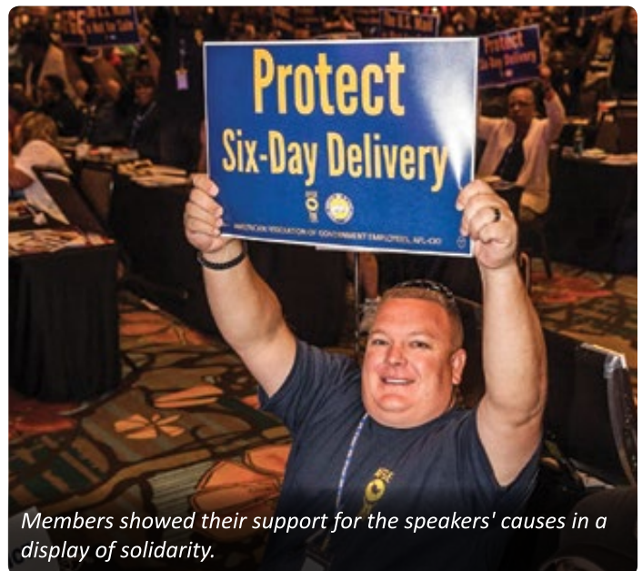
Members showed their support for the speakers' causes in a display of solidarity.